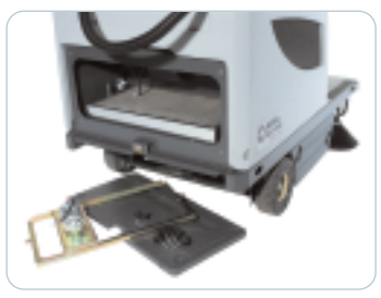
Nilfisk's famous no-tools concept allows fast and easy replacement of brushes and filter for minimal downtime